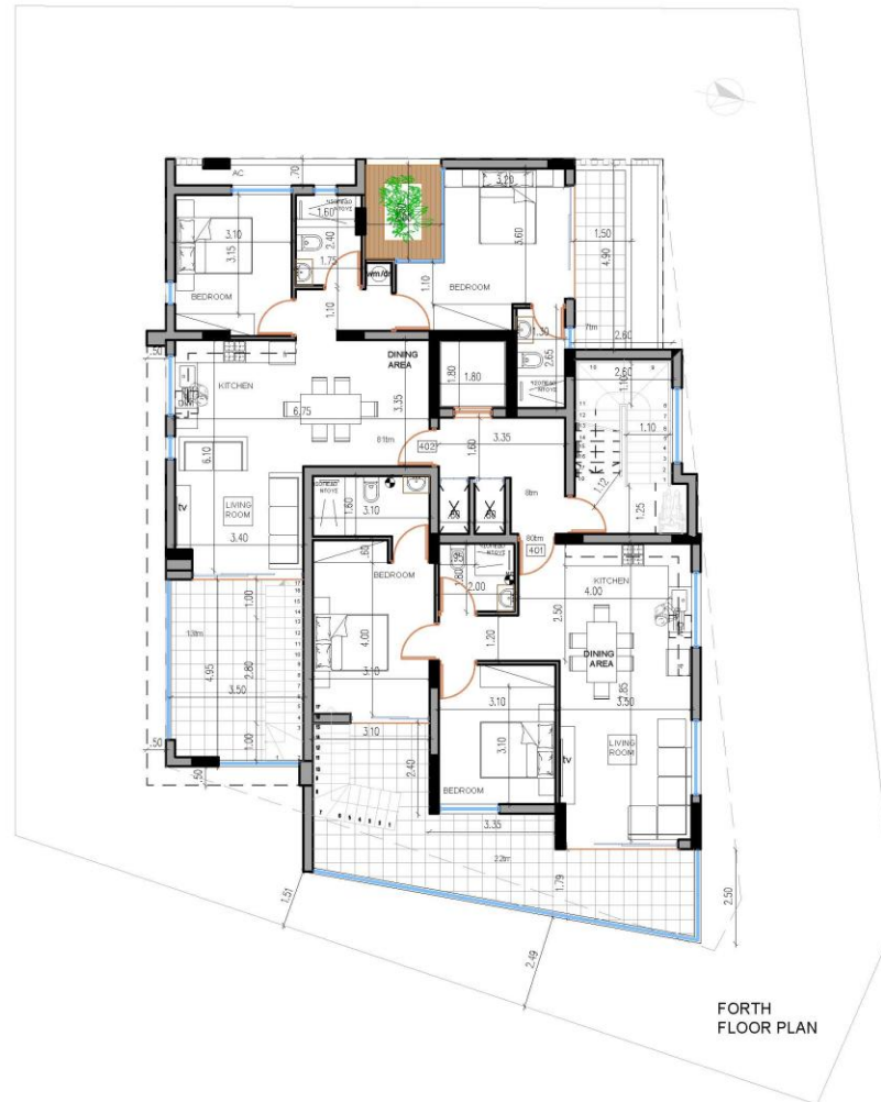
FORTH FLOOR PLAN